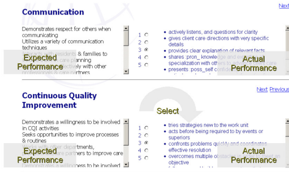
Guided on-screen evaluation

...makes well-crafted performance feedback easy!